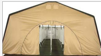
End View, shown with Connector Door Part #7837. Center Divider creates 2 isles, together with 14 privacy curtains create 16 private patient rooms.