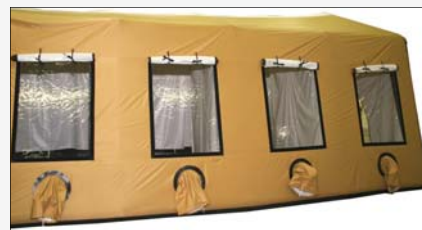
Windows with Roll-up Cover Part #7814, shown with Cover rolled open. Up to 16 available.