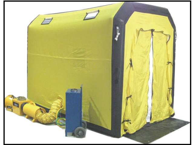
Shown above: Rear Door of Mdl 70, center zipper door with connection zipper along with part # 9906 propane tent heater and # 9952 electronically fired propane water heater.