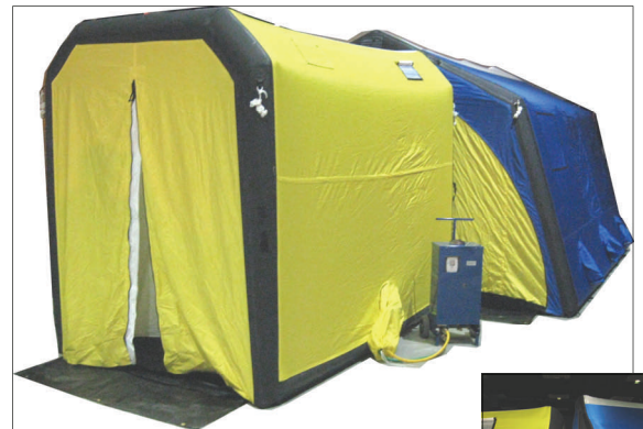
Shown above: Front Door of Mdl 70 with part # 9952 electronically fired propane water heater.