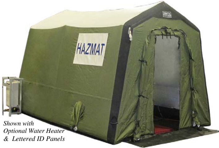
Shown with Optional Water Heater & Lettered ID Panels